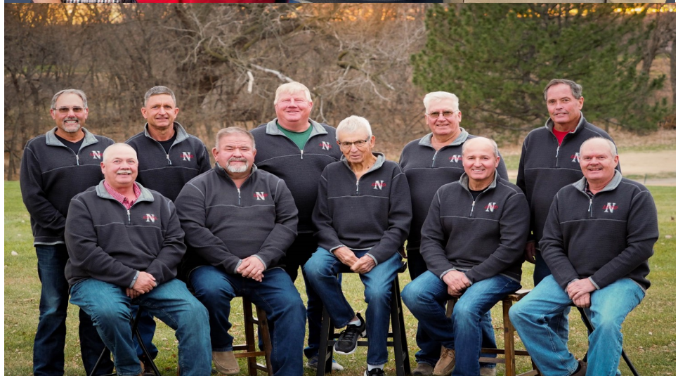
Lower Republican NRD Board of Directors